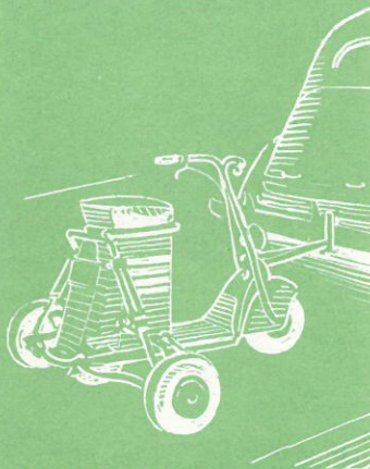
AUTOMOBILE PICK-UP AND DELIVERY

Col. Roscoe Turner 540 No. Michigan Avenue Chicago, Illinois.