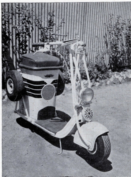
Above: Cycletow with wheels raised for service.

THIS SERVICE used to be an expensive matter, due to high cost equipment and heavy maintenance expense. NOW ALERT OPERATORS render pickup and delivery service at nominal cost, with the