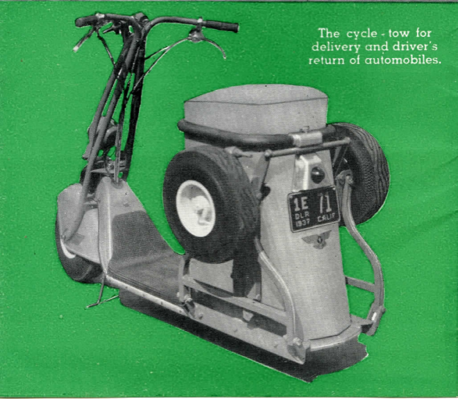
The cycle - tow for delivery and driver's return of automobiles.