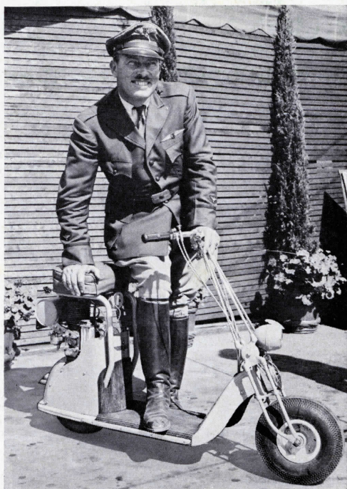
Col. Roscoe Turner and his MOTOR GLIDE