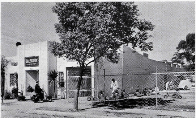
General Offices - Salesroom - Factory